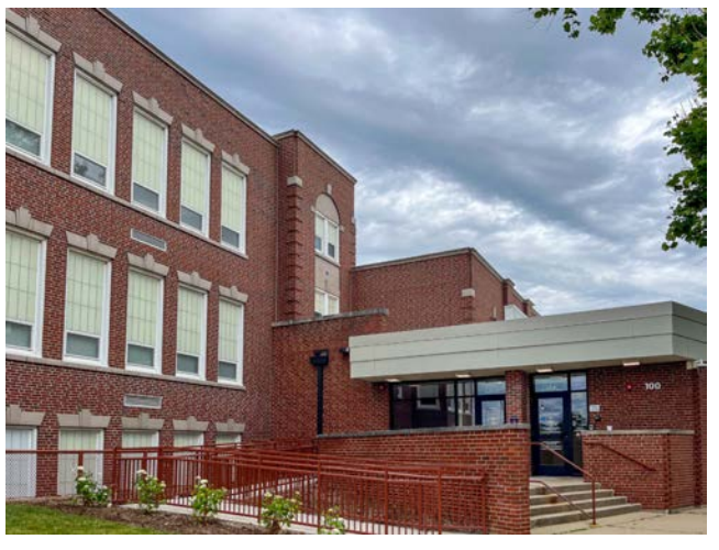
Built to replace a school facility that burned in 1927, Mary A. Todd takes its name from a former school principal.

general contractor, while Cordogan Clark & Associates provided design services for the redevelopment involving the adaptive reuse of two historic schools, as well as the construction of a new building. The Aurora City Council approved the project in October 2021.